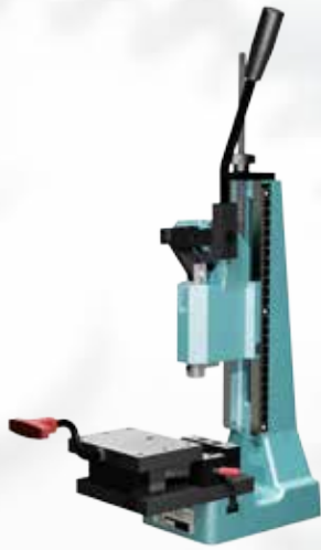
EP 500 with MST 80