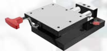
MST 80 MST 100