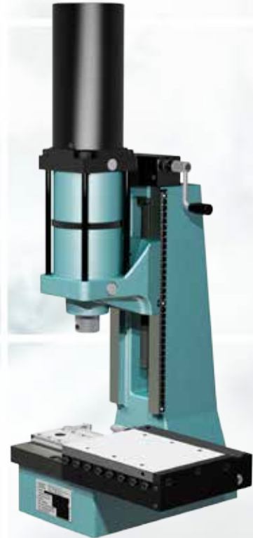
Installation from the side