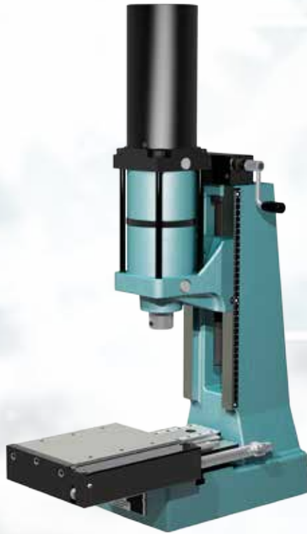
DA type press with PST 130 Installation from the front